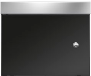
COUNTERTOP COOLER (LARGE)

This model boasts a removable milk tank and offers the option of sensors for milk temperature and a milk empty message.