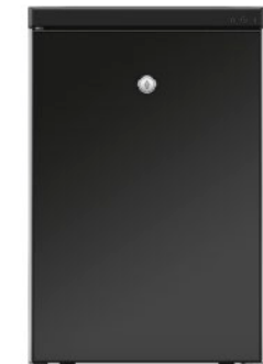
COUNTERTOP COOLER (MEDIUM)

This model boasts a removable milk tank and offers the option of sensors for milk temperature and a milk empty message.