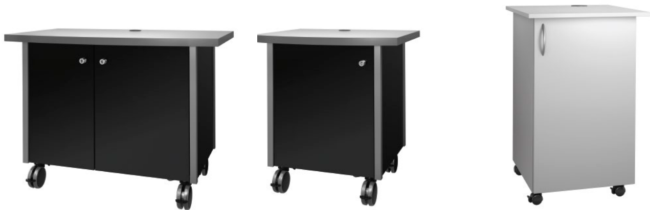
MOBILE COFFEE STATION 125+ / 85+

DELIVERING COFFEE INDULGENCE, IN TOTAL AUTONOMY