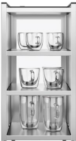
CUP RACK, NARROW

Made with high-quality, easily cleanable stainless steel and shatterproof glass, WMF cup racks are designed to be positioned directly next to the coffee machine. So your cups will always be close at hand, and just the right temperature. Transparent side panels make for easy inspection, and coloured LED lighting can be adjusted to suit your venue.