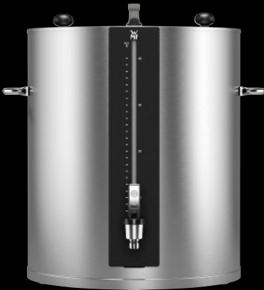
HEATED THERMAL CONTAINER (40L)

CONSISTENT TEMPERATURE FOR CONSISTENT TASTE