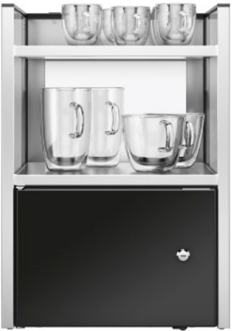
CUP & COOL, WIDE

ONE UNIT, TWO FUNCTIONS: WARMING AND COOLING