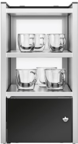
CUP & COOL, NARROW

Contained within the same footprint as a standard cup warming rack, WMF Cup&Cool units combine both cup warming and milk cooling functions. For maximum hygiene, the milk tank is removable, easy to clean and easy to fill, while the optional milk volume sensor lets you know when to refill. The lockable door is ideal for self-service venues.