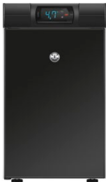
COUNTERTOP COOLER (SMALL)

Designed to be placed between two WMF coffee machines or next to a single machine, this Countertop Cooler features a removable 10.5-litre milk tank and a digital display showing the milk temperature.