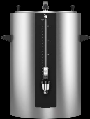
HEATED THERMAL CONTAINER (20L)