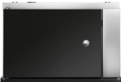
UNDER-MACHINE COOLER (WMF 9000 S+)

The large capacity of this Countertop Cooler makes it suitable for use with either one or two WMF coffee machines, with milk hose routing on both the left and right sides. Milk temperature and milk empty sensors are available as an option.