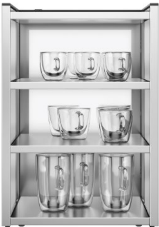
CUP RACK, WIDE

PERFECTLY WARMED CUPS, STYLISHLY DISPLAYED