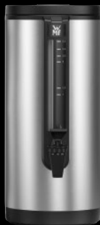
THERMAL CONTAINER (2.4L)

The range of thermal containers for use with the WMF 9000 F includes an insulated pot with a 40-litre capacity and a 20-litre model, as well as a 2.4-litre model which can be filled from the pot brewing arm, and is also suitable for use with the WMF 9000 F (Internal Storage).